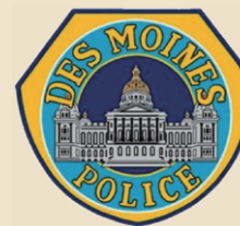
Des Moines Police Department

The Government Agency of the Year Award recognizes the extraordinary work of a municipal, county, or other state agency in Iowa that has demonstrated exemplary practices or programs in one or more of the following ways: