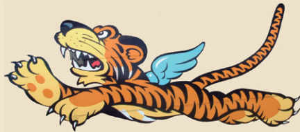
Flying Tigers The American Volunteer Group (AVG)

The Outstanding Contributor Award acknowledges individuals and organizations that have made an extraordinary contribution to the State of Iowa and beyond.